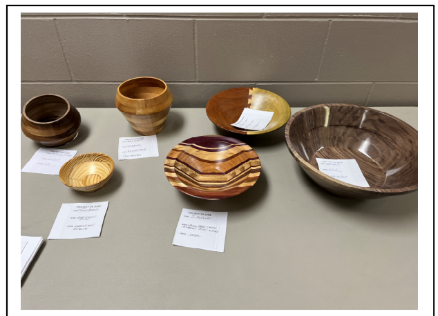
Project 24 bowls from a board