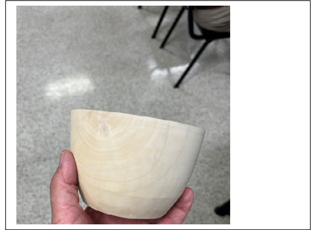
Bowl rough turned.