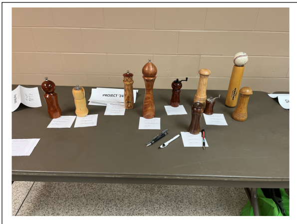
Project 24 – Pepper mills.