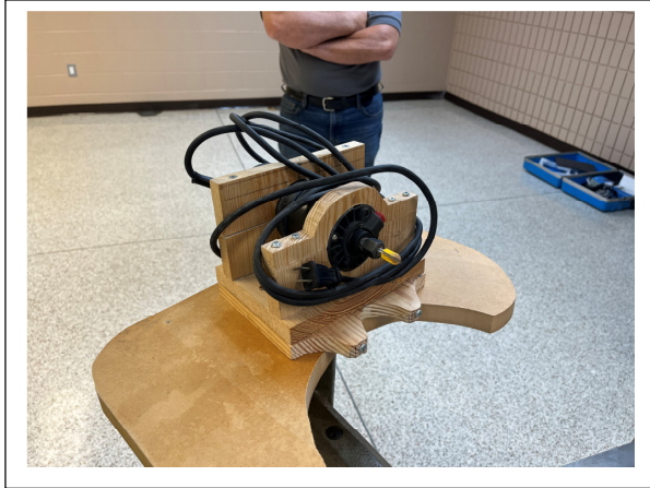
Mike Linkswiler Pumpkin fluting